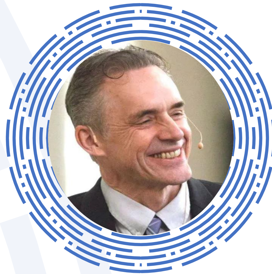
Jordan Peterson Professor of Psychology